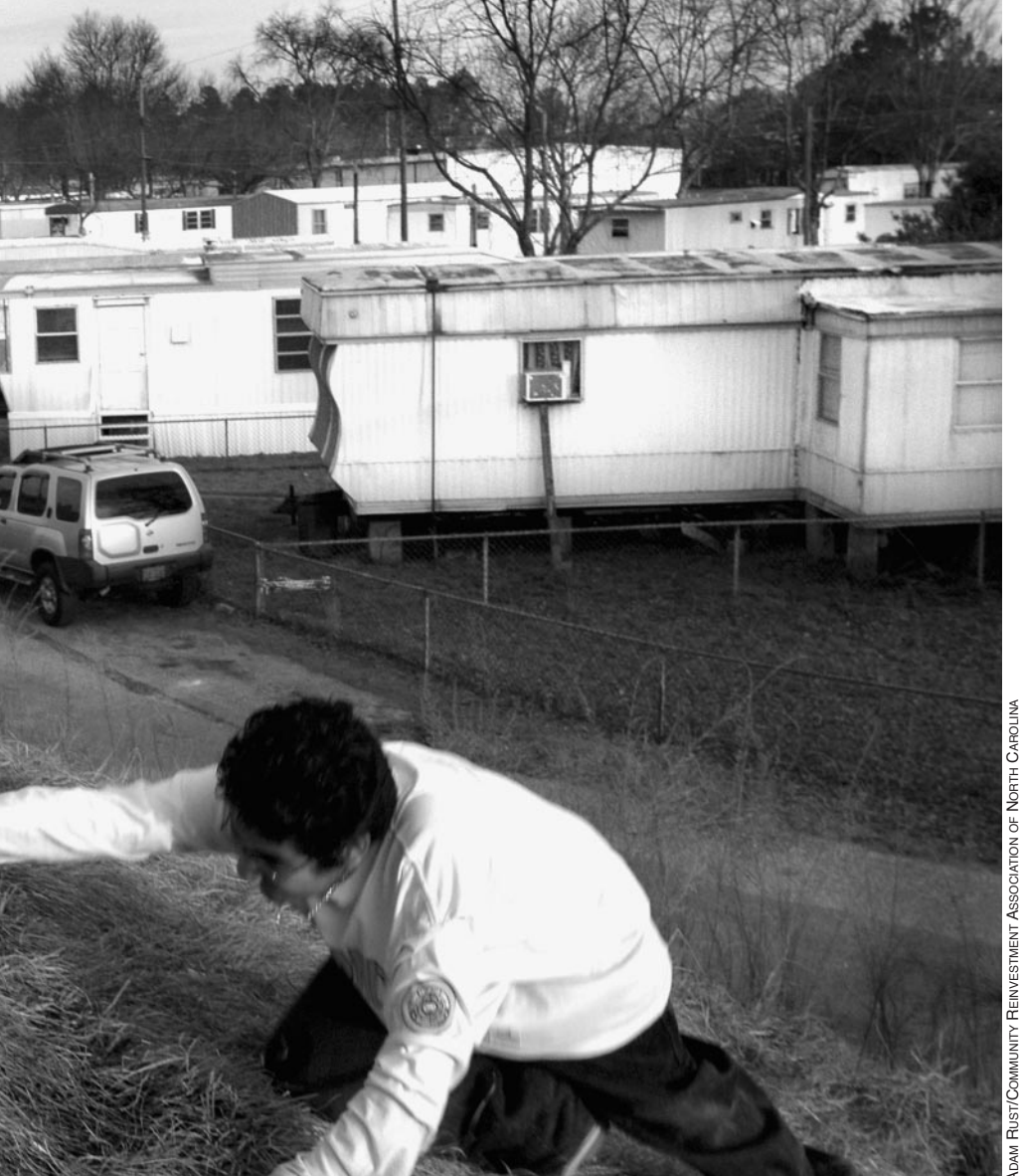
Children play on the highway berm above Dreamland, the mobile home park where they live, in Sanford, North Carolina.

article also identifies issues affecting consumers and the community. Finally, it recommends the rehabilitation of land-lease communities as a community development strategy to provide safe, affordable neighborhoods.